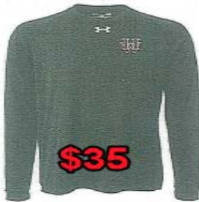
Men's Long sleeve