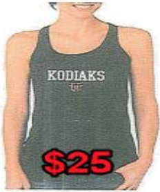
Ladies Racerback Tank

LIMITED quantities available at the office. These won't last long and you will NOT be able to order items. CASH ONLY