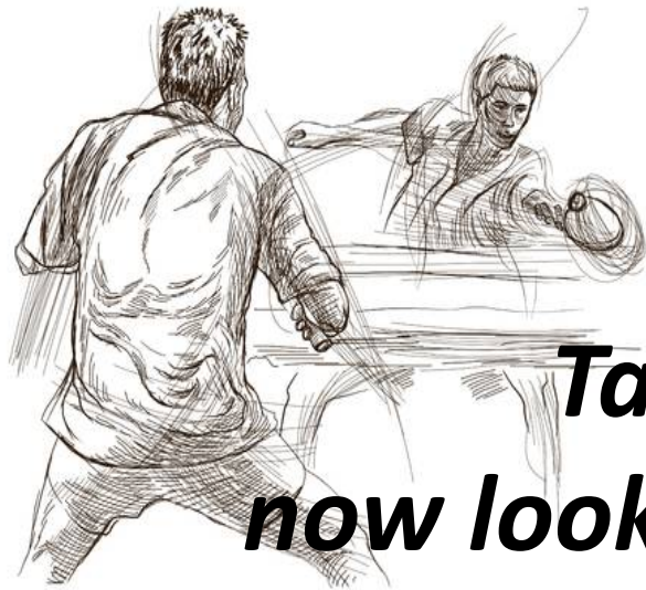
Table Tennis Club now looking for new members

When: Monday/Wednesday After School Stay till 5pm (Not mandatory, leave whenever you want) Go to Room 234 Thursday during flex in order to sign up!