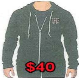
Ladies Full-Zip Hoodie