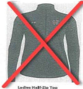
Ladies Half-Zip Top